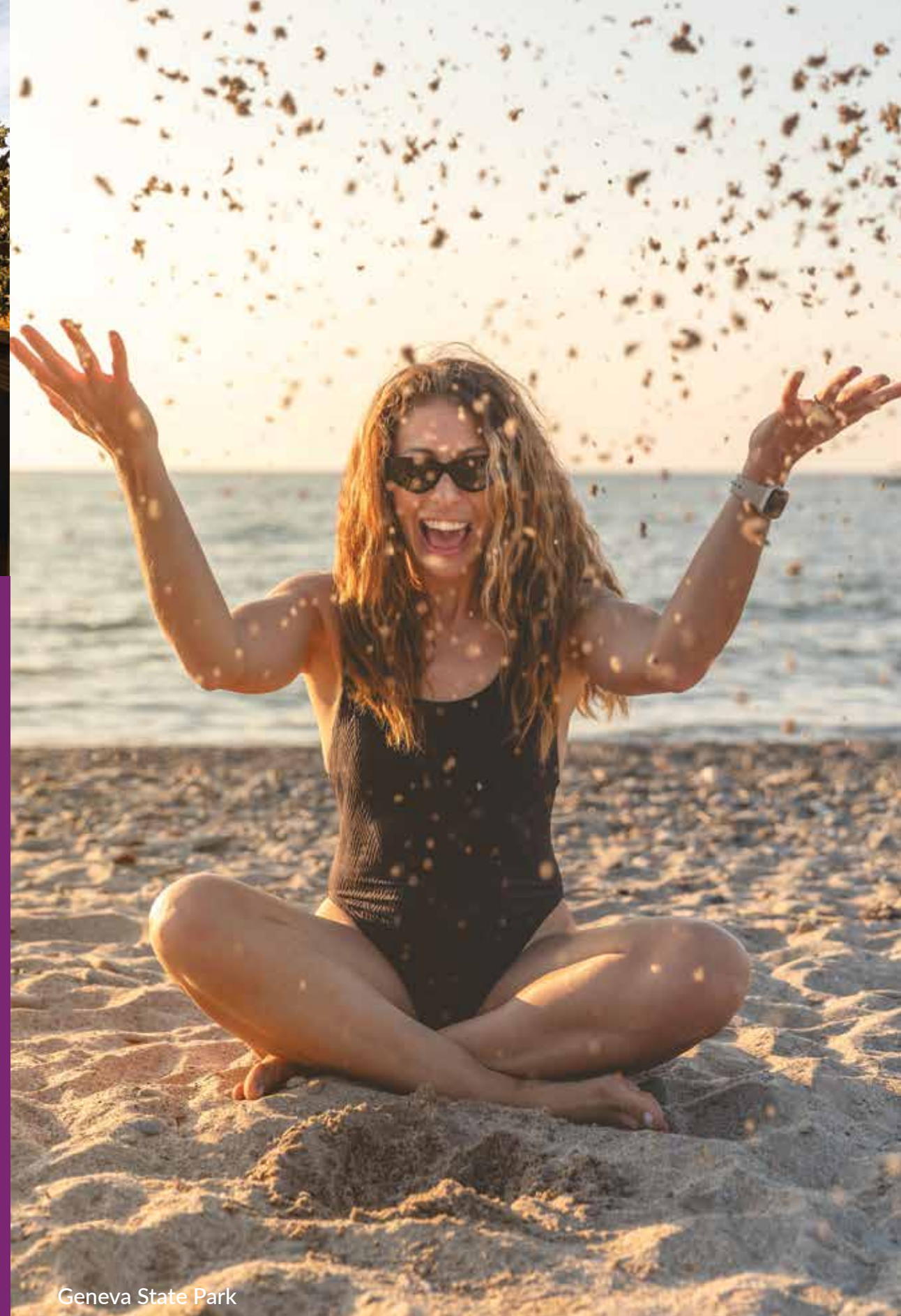
Geneva State Park