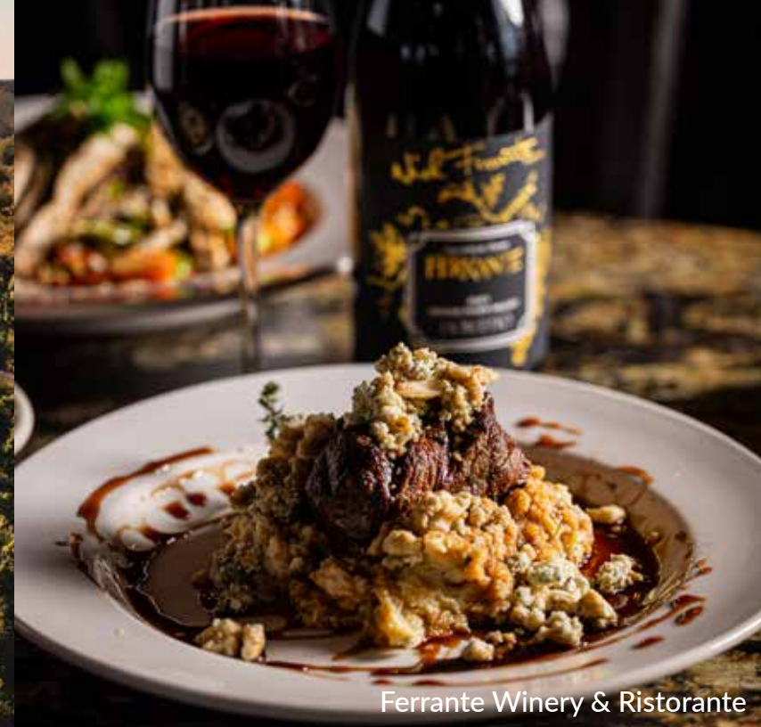
Ferrante Winery & Ristorante