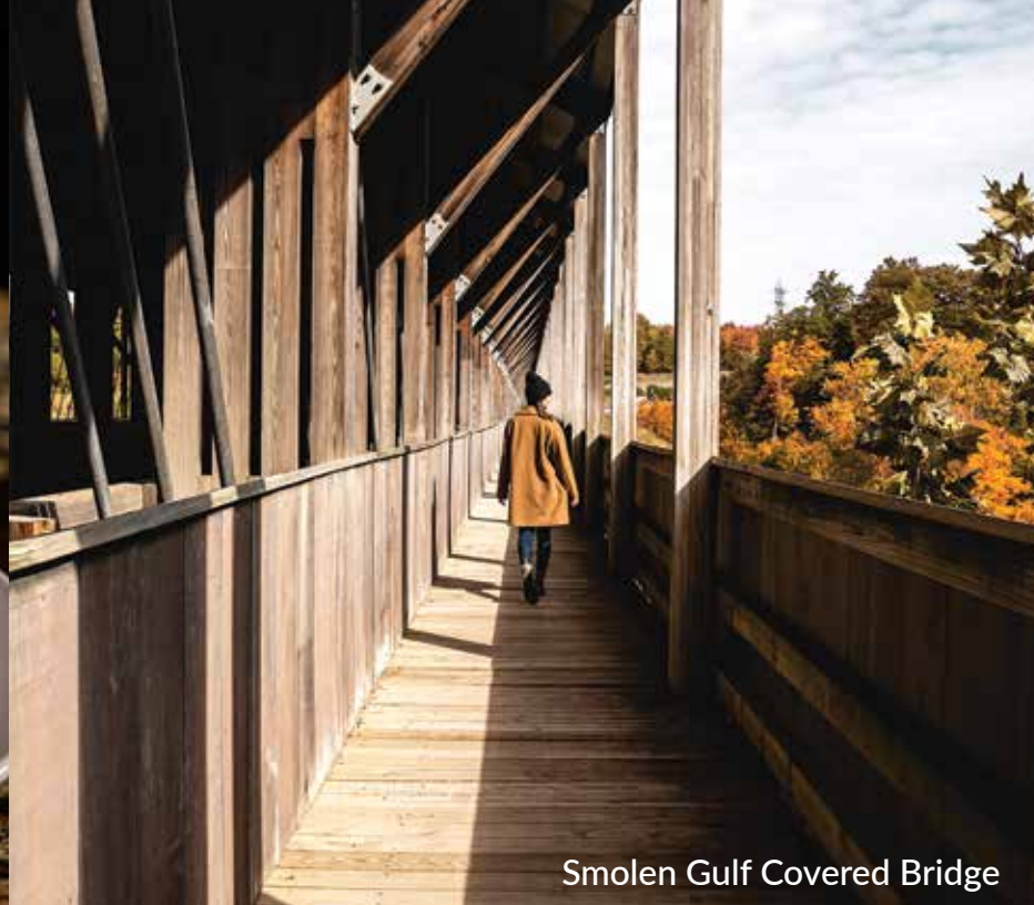
Smolen Gulf Covered Bridge